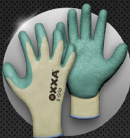
X-GRIP 51-000 Art. no. 1.51.000.00