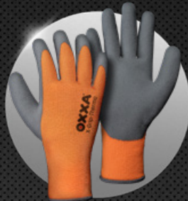
X-GRIP-THERMO 51-850 Art. no. 1.51.850.00